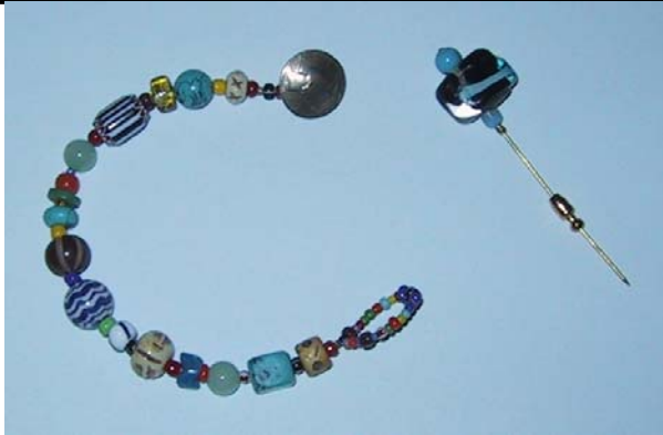
Examples of Kit's glass bead jewelry

open in the fall of 2006 with construction well underway just across the Reservoir from where she currently works.